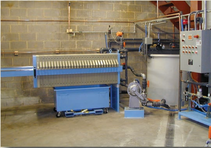
Beckart automated systems are regulated by PLC controllers that we assemble and program in-house. The system makes all of its own wastewater staging and sequencing decisions, and fine tuning, diagnostics and adjustments are easy to facilitate.