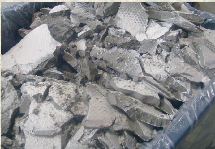
Dry, landfillable filter cake after wastewater processing with a Beckart system.