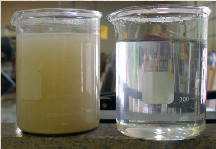
Actual water samples before and after processing with a Beckart system at a Midwest stone fabricating facility.